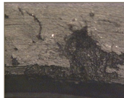
Pitting on filter end-cap

Parker has developed a unique modified filter media technology to aid industry in controlling static build-up in non-conductive hydraulic and lubricating fluids.