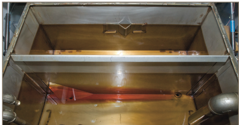
Varnish is attracted to metal surfaces, this results in an overall decrease in productivity.

Manufacturers of combustion turbines have recognized the relationship of static discharge causing thermal degradation and subsequent varnish formation to the extent that they have suggested turbine users to choose coarser filtration, including switching from Micro-glass to less efficient Cellulose filter media and also to decrease flow density by operating duplexing filter changeover valves in the center position. Parker Static Control filter elements eliminate these compromises and ensure proper system filtration performance.